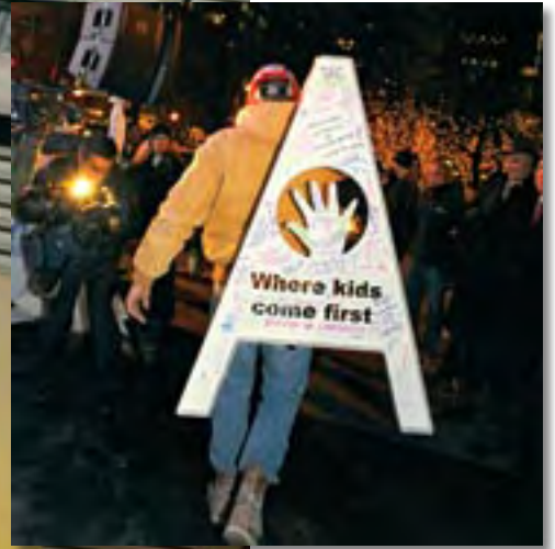
Construction workers carry the steel beam, complete with signatures from children, families, hospital staff, donors, construction workers and others.