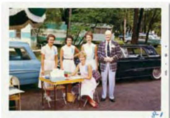
Volunteers at the inaugural Pro Am in 1961, which raised $65,000 for the hospital.

It's been said that good ideas are common; what's uncommon are people who will work hard enough to bring them about. Decades ago, members of the Founders' Board and their friends had both the vision and the resolve to create a new channel of ongoing support for the hospital's patients and families.