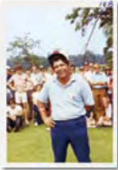
PGA professional Lee Trevino at the 11th annual Pro Am in 1971.