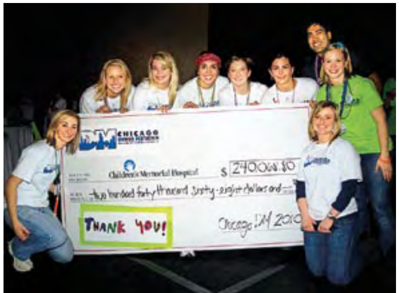
Members of the event's executive council celebrate the fundraising success of the inaugural Chicago Dance Marathon.

Hundreds of energetic and caring individuals came together on March 6 at the Hyatt Regency McCormick Place, which generously donated the event space, to stand and dance for 13.1 hours in support of all the brave children at Children's Memorial Hospital. The first-ever Chicago Dance Marathon, presented by KPMG, was a phenomenal success, raising more than $240,000 for the hospital, thanks to nearly 300 dancers and teams, along with many dedicated volunteers and sponsors. Dozens of patients and their families shared their inspiring stories and enjoyed an array of entertainment and festivities. Excitement is already building for Chicago Dance Marathon 2011. Visit chicagodancemarathon.org for more info.