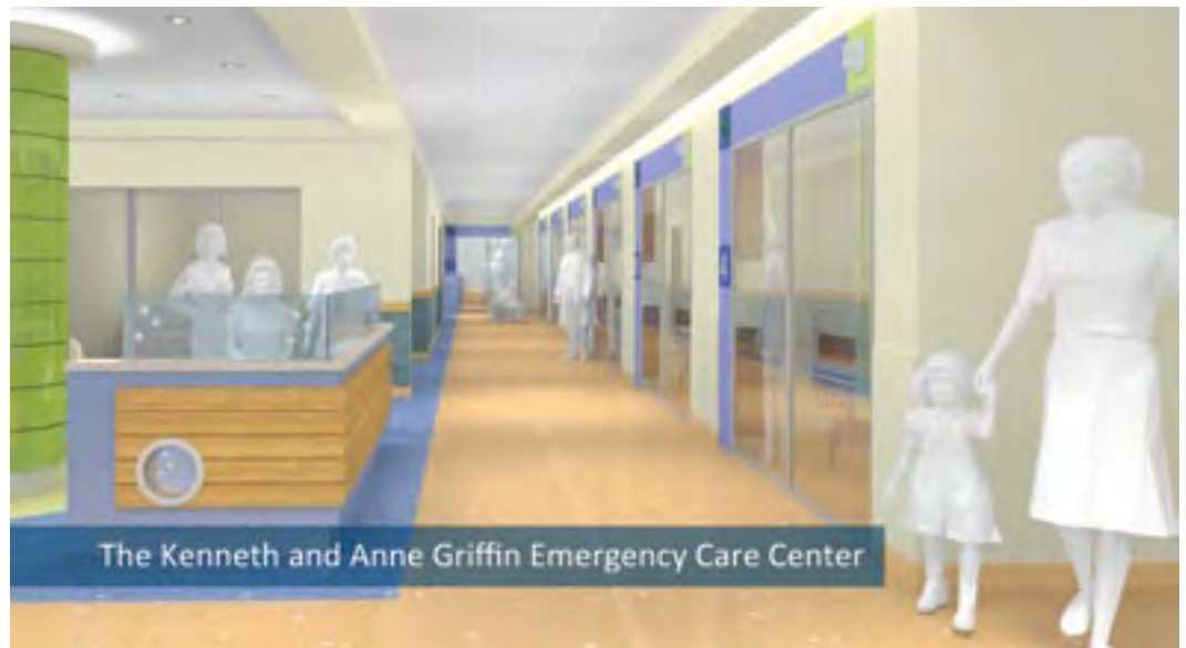
A rendering of a nurses' station in The Kenneth and Anne Griffin Emergency Care Center at Lurie Children's.