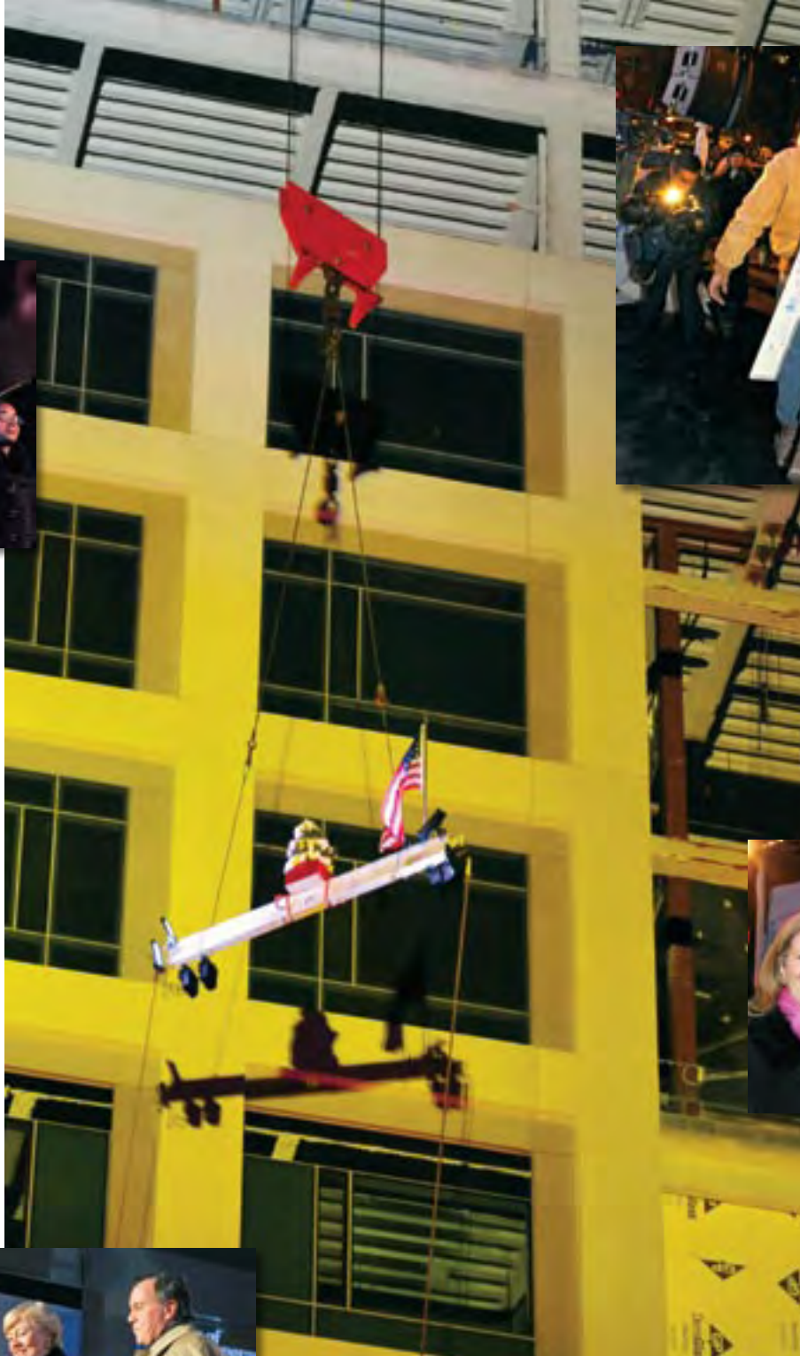
The last steel beam makes its journey to the top.